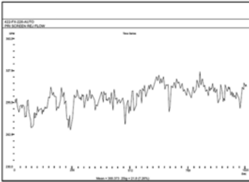
FIGURE 1. Past Magmeter Performance.

The High Signal technology generates a magnetic field ten-times stronger than the Dual-Frequency meter from the other manufacturer, which proved to be a key difference in this difficult application. This stronger field delivered the results that Boise-Cascade needed to stabilize the flow measurement with minimal damping, allowing Boise-Cascade to improve process control and ultimately paper quality.