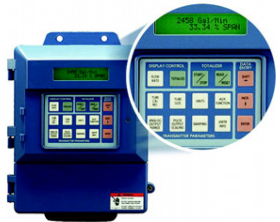
Rosemount 8712 High Signal™ with easy-to-use Local Operator Interface (LOI).

The High Signal Magmeter reduced process variability by 85%.